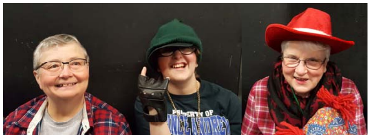
Actors backstage at last year's "Something's in the Air"

If you liked "Something's in the Air" last year, you'll love this year's production of "Juke Box Musical" .