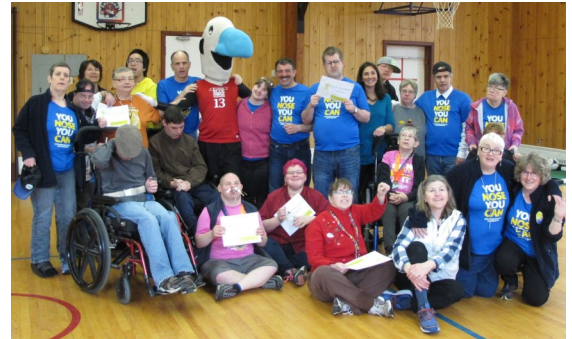
Team Bonny Lea Farm and Myles the Mascot

Our team has surpassed our $7500 fundraising goal! Thanks to our donors for their generous support. See you at the finish line!