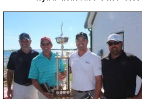
Stone Depot won this year's tournament!