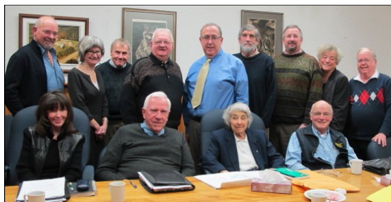
Bonny Lea Farm Board of Directors

Bonny Lea Farm's Board of Directors spend many hours sitting on various committees to ensure the sustainability of our operation. September will mark our 41st year of providing a service for men and women living with a disability.