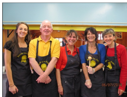
Volunteers & staff at the Breakfast & Plant Sale