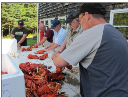
The Lobster Cracking Team who can crack 600 lobsters in 1 hour!