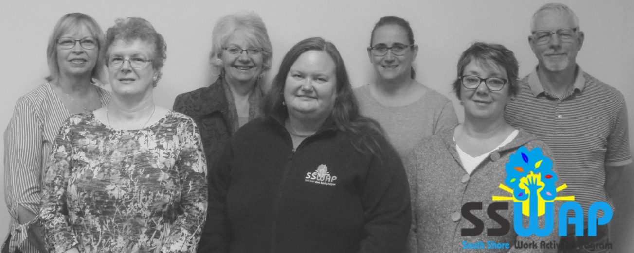
South Shore Work Activity Program Staff