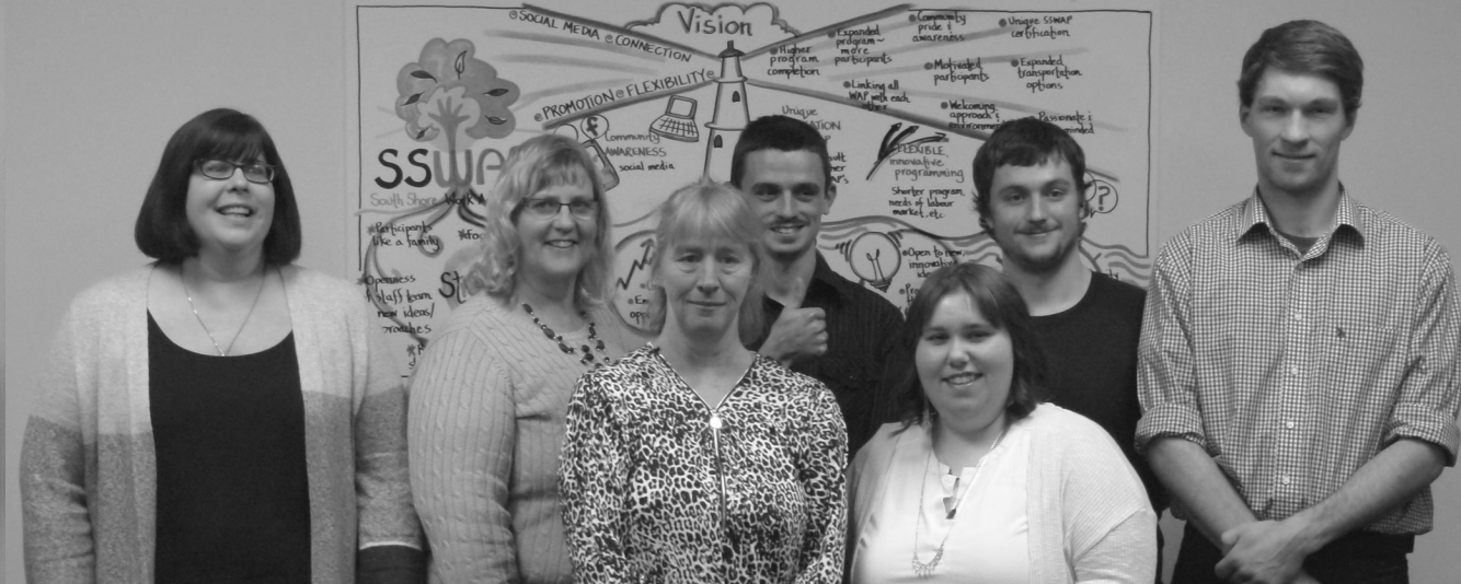
South Shore Work Activity Program Graduates