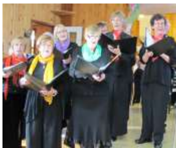
The Studio Singers

Bonny Lea Farm was hit with 'spring fever' on April 9. There was clapping and toe tapping to the sounds of the performers on stage. The Bonny Lea Chorus sang "This Little Light of Mine" and the place rocked when The Studio Singers sang the Freddie Mercury classic, "We are the Champions" with lyrics to honour all of us at the Farm. Here are a couple of the re-written lines: