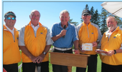
Basin Stationary- Tournament's Best Dressed Team featuring Bonny Lea's logo.