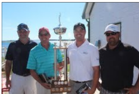
Stone Depot won this year's tournament!