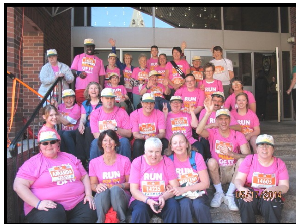
Team Bonny Lea Farm 2014